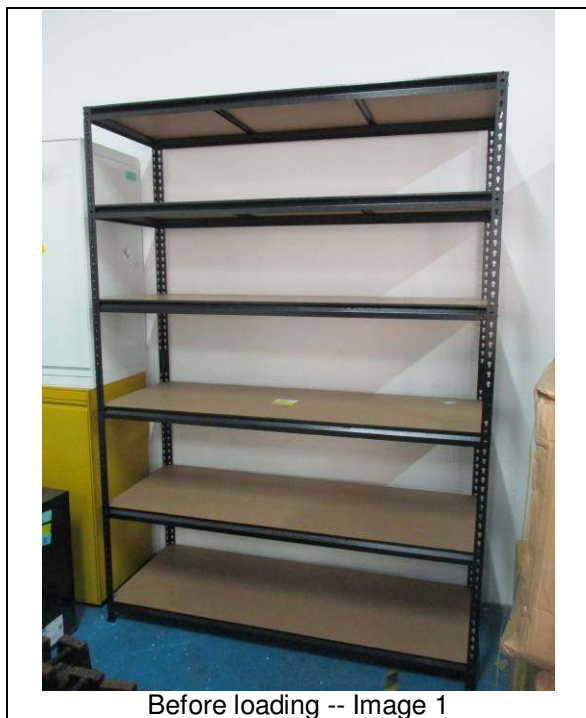
Before loading -- Image 1