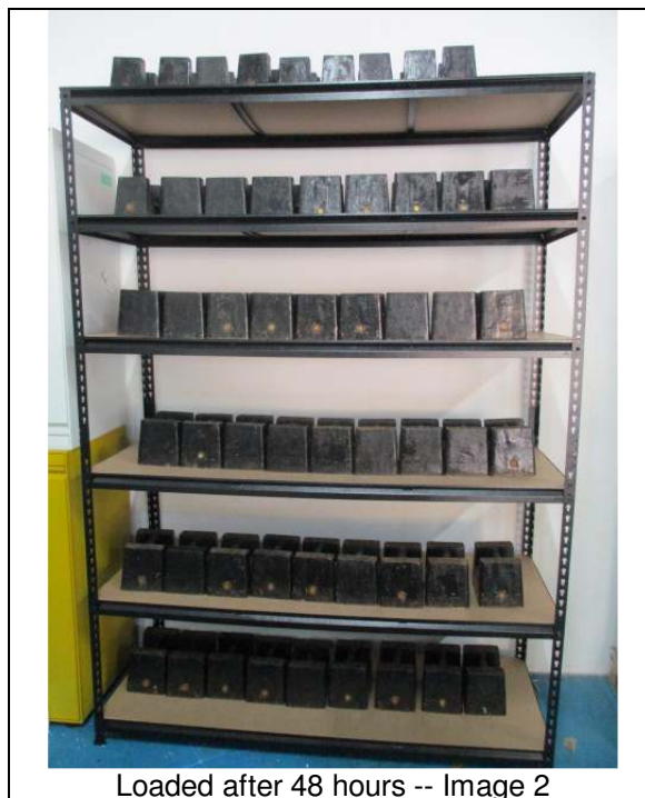
Loaded after 48 hours -- Image 2